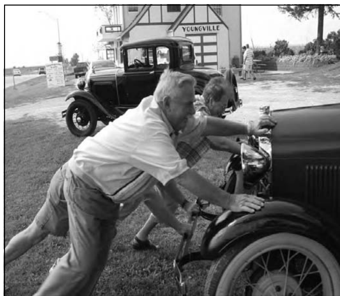
Jumpstarting the Model A at Youngville's Apple Daze on September 21