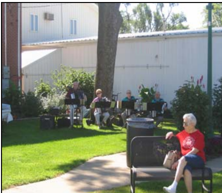
Our Musical Entertainment-Lowden