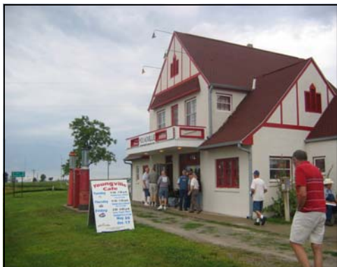
Arriving at Youngville Café-Benton Co.