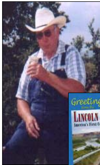
The Olde Retired Cedar County Sheriff