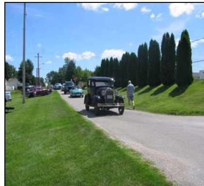
Arriving for Lunch-Clarence