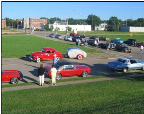
Lining Up to Begin The Tour-Clinton