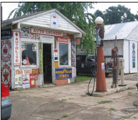
Preston's Station-Belle Plaine