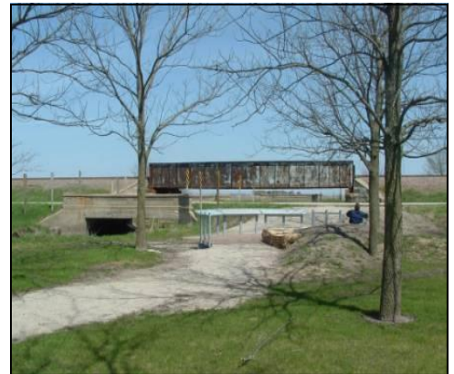
Greene County Interpretive Site

In 1997 the Iowa Department of Transportation awarded this project the first of several important enhancement grants to support Lincoln Highway resources across Iowa. Built with that grant were an identification sign, entrance drive, parking, deck and seating for group presentations, trail, structures that identify the states and Iowa counties that the Lincoln Highway passes through and the structures for some of the interpretive panels. The most visible element is a set of "decade markers" that demonstrate the growth of population, road pavement and automobile ownership from 1910 to 1990.