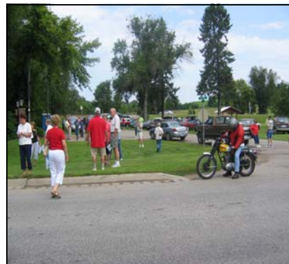
Lincoln Highway Bridge Park-Tama