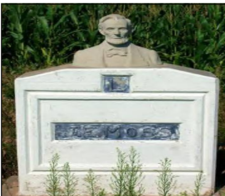
Moss Marker on LH-Greene County