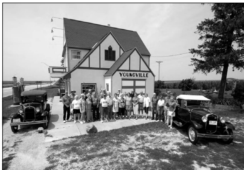
"Hawk A" Model A Restorers Club celebrates International Model A Day on July 26, 2008 at Benton County's Lincoln Highway Landmark, Youngville Café