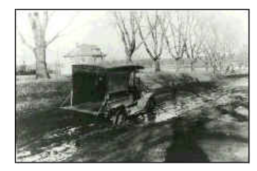
Briley's grocery delivery truck heads east down hill on Lincoln Way toward Beach Avenue corner and the Squaw Creek bottom grade. Dormitories now occupy all of the area where the farm house sits in this photo.