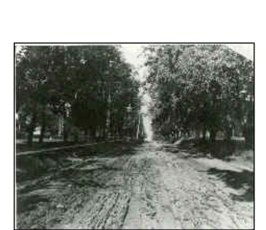
Lincoln Way approaching campus, looking westward. On right women's dormitories, on left today are fraternity houses.